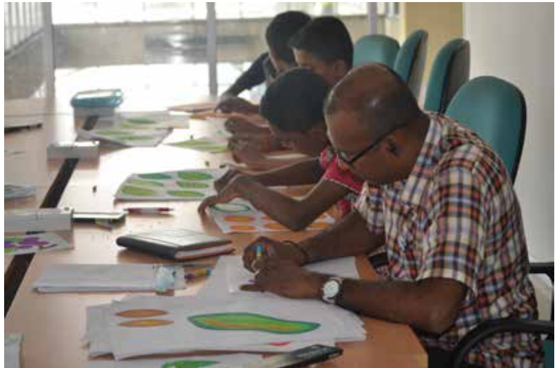
"Color and its nature-Painting together with students"