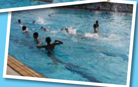
"Swimming sessions conducted at Dewan Sukan Pandamaran"