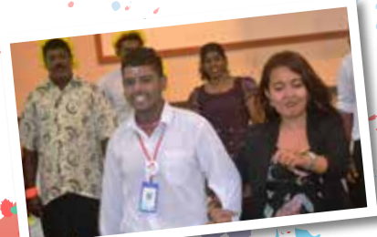
Catwalk with style.