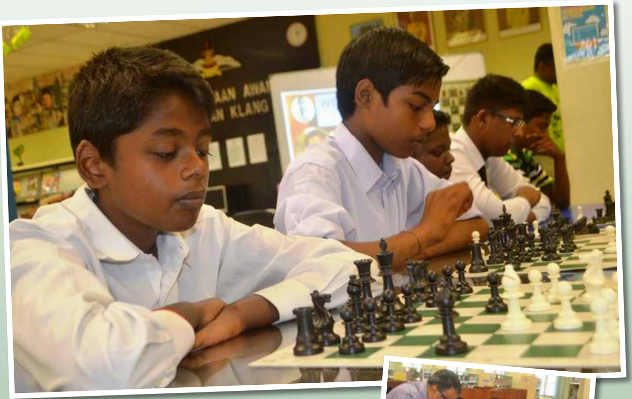
ALL VS One – chess match with malaysian chess candidate master”