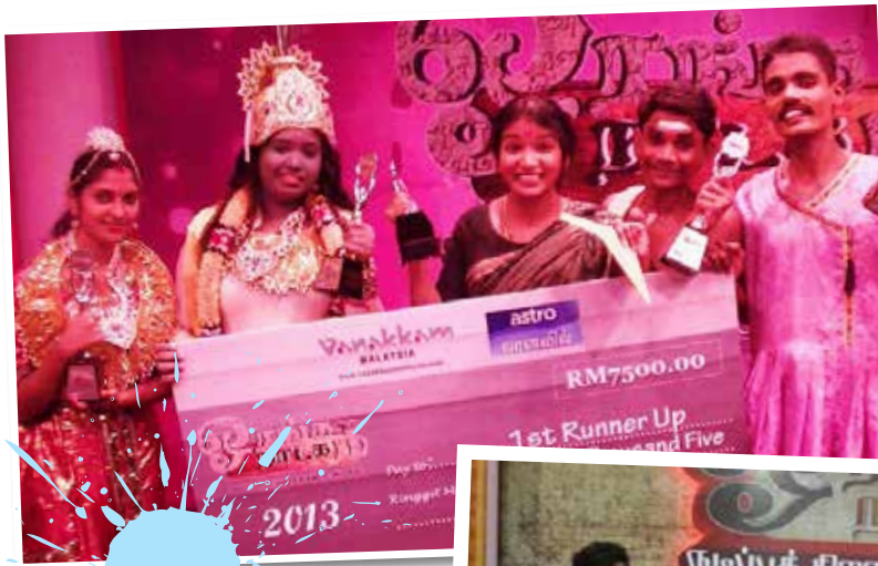
Winner of 2013 Orangga Naadagam 1st runners up.

"Myskills team had participated almost three years in the Drama Competition organized by Vanakkam Malaysia and Astro Vaanavil since year 2013 upto 2016. Only on year 2015, we decided take a break and come again fresh on the following year and start focusing other talent areas. Throughout the training and preparation period, most of the participants undergo huge character transformation effect, and that itself gave them competitive edge in the overall pursuit to win."