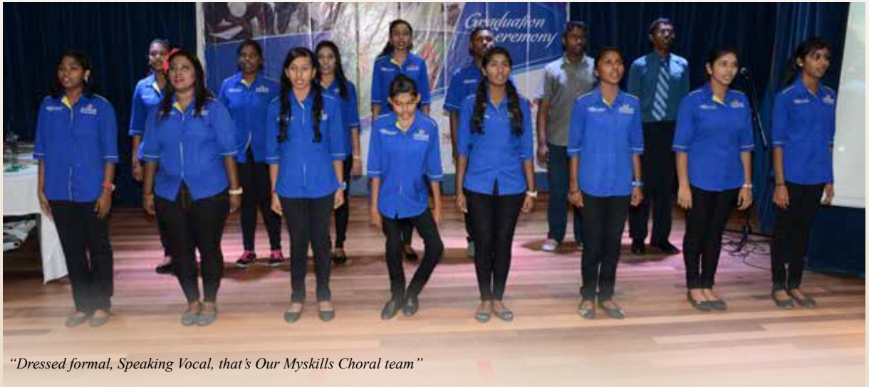
"Dressed formal, Speaking Vocal, that's Our Myskills Choral team"