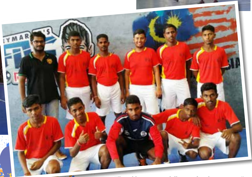
"Fustal boys testing skills open futsal tournament"