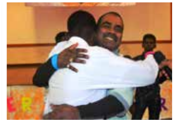
Best father award winner.