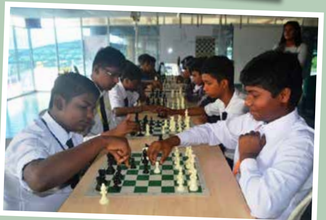
“Myskills Chess Tournament 2015”