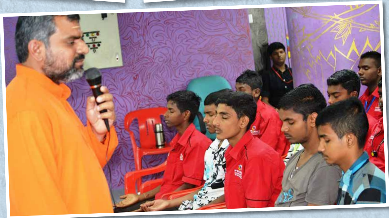
Regulating self-control on focus and privities in daily progress.