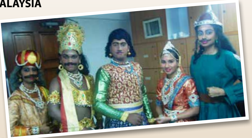
"Ethirneechal and Pagalavan Team In Action !

In 2013, Myskills students participated in the first Stage Drama Competition organized by Astro-Vanakam Malaysia. We competed against 100 over higher education institutions and emerged as 1st Runner Up. In 2014, Myskills competed again and we became the CHAMPION. But in 2015, we took a break.