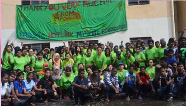
"Maxis Corporate team with Myskills Army on a mission"