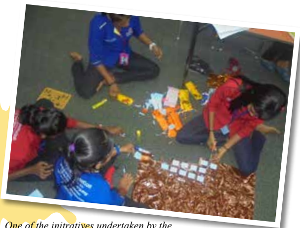
One of the initiatives undertaken by the girls to create recycle handicrafts.

This groups managed to create various type of bookmarks with the concept of nature and it was their 1st time involve in this social business which allows them to decide on their items which is the handicraft from recycled products.