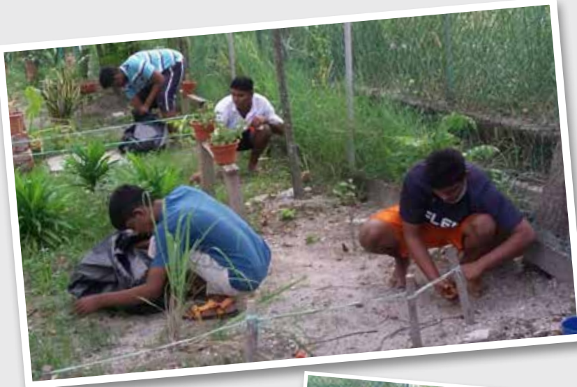
“Daily task to water plants, clean and help to preserve the hostel environment”