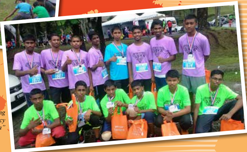
"After completing 7km Fun Run by Mercy Malaysia"