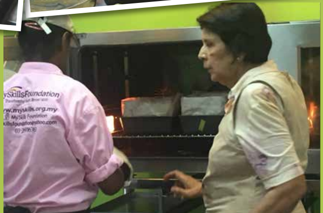
"Training the young bakers on fruit cakes"