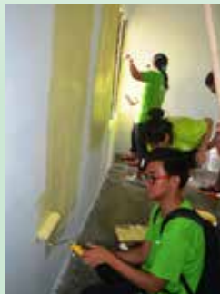
Volunteers and students everywhere in paintly, gardening, cooking and building.