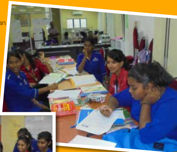
Imbroging communication skills thought basic steps

Our secretary student had the chance to join and participate in this program which will be going on for 3 months (April 2016 – June 2016) at MySkills. They will be awarded a certificate upon completion in July 2016. Our students have developed and increase their vocabulary through BI1M classes. Learning English Through games and discussion made it more fun for the students. They are engaging well during the lesson taught with the volunteer from BI1M.