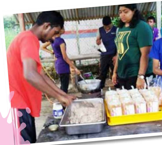
"REX adding value to daily/weekly menu"

This contribution had made possible for us to provide variety of food for the underprivileged youths underlying transformation programme at MySkills. We always extend our heart-felt gratitude for supporting our mission towards developing and transforming our youths. Our organisation is actively striving to provide the best for our students. Indeed, this project is helping us to reach closer to that. We sincerely appreciate THE REX TEAM for their endless support.