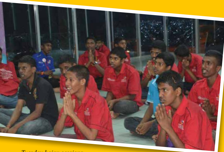
Tuesday hajan sessions at assembly hall.

Many of our students have confessed of having poor self control and never thought that a positive change would be needed to improve their lives. We believe continuous spiritual guidance helps students to stay on track and transform them holistically to some extent.