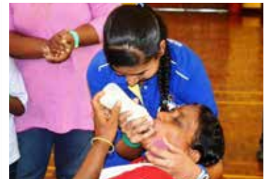
Children feeding the parents.