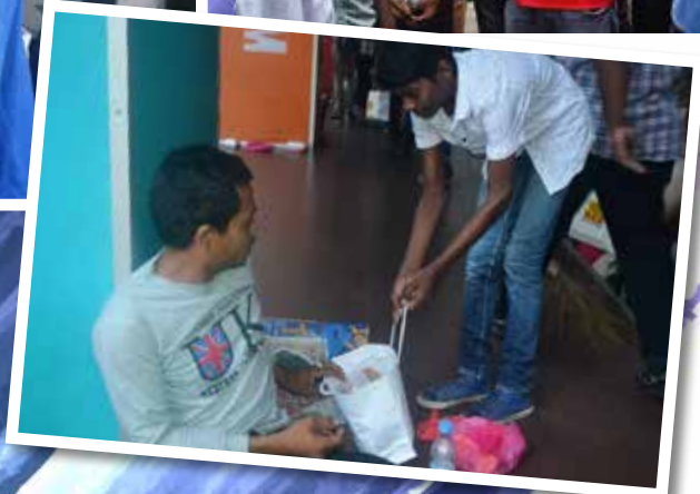
Creating empathy and sharing the needs of homeless.