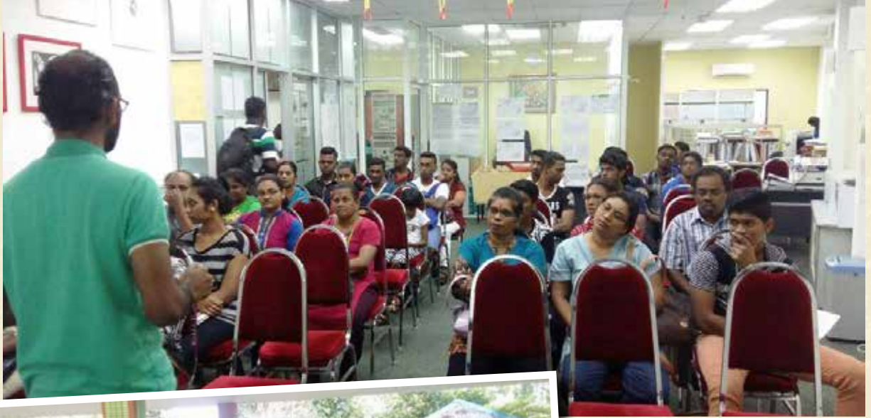
Student briefing for IKBN registration day after successful application.