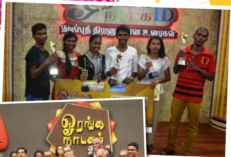
Winners of 2014 Orangga Naadagam Champion