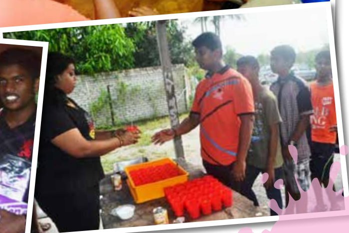
Refreshing rexbena after tiring activities – sport, gardenia, cooing and meetings.