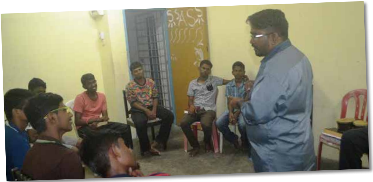
Church volunteers guiding on tuesday sessions at hostel.