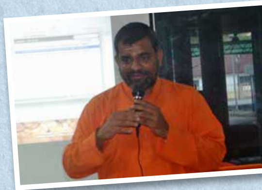
"Spiritual talks and meditation by Hindu Sangam and volunteers"

Most of our students are found to love 'ritual practice' rather than ritual belief. They love worshipping 'demigods' and to our surprise some even were found worshipping weapons. In pursuant to this, Temple visits and spiritual talks have been frequently organised aiming to give the students a better understanding on religion and its universal positive values that one should try to internalise and practice.