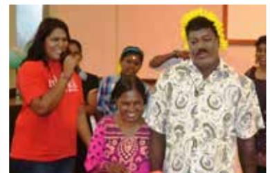
Best make up match participants.