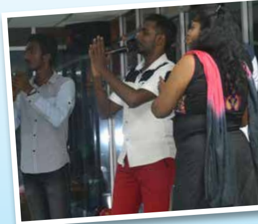
Dance, singing and drama to build confidence

All students are encouraged to participate in the Friday Night Fever (FNF) celebration on every Friday of the week to showcase their talents. Students are to perform a dance or song number in front of their friends and teachers. Those who perform well will be given an opportunity to represent Myskills Foundation in other related programmes or competitions to move them a step further.