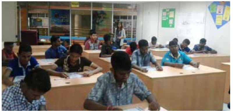
“Weekend training on both skill and enterprise model.”

to complete their programme and graduate from Myskills show greater interest in these classes because they open them to various job opportunities to explore. These additional skills classes are conducted every weekends to ensure they do not disrupt other programmes and activities run by Myskills on the weekdays.