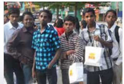
"Feeding the homeless on weekends with REX corporate team"