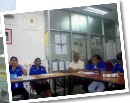
"Weekly session on easy way of understanding Maths"