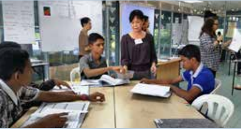
"Building right values for better future"