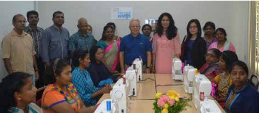
"Empowering single mothers for micro business model through tailoring"