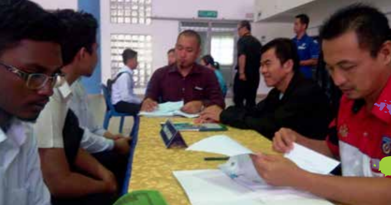
Students registering in IKBN