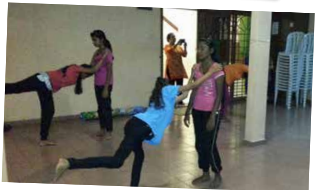
Practicing lessons learnt on evening after returning from class.