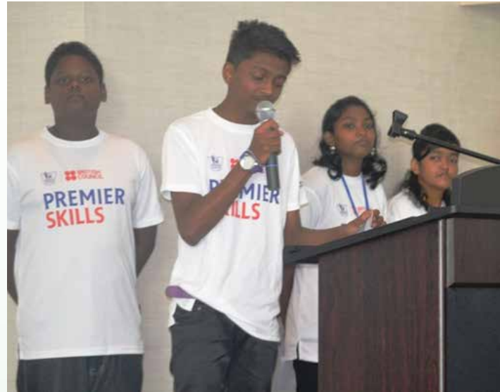
"Enterprising through Football- Young Managers"