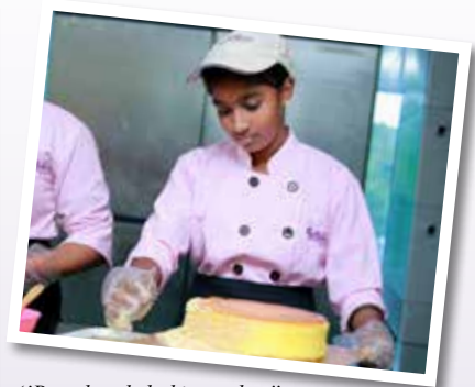
'Busy hands baking cakes''

Mybakery is also focused to expand through micro enterprises right after the students complete their two year training by providing seeding funds for the business start-up. This will create more impact on the socio-economic status of the families as most of the belong (Bottom 40 %) of the society.