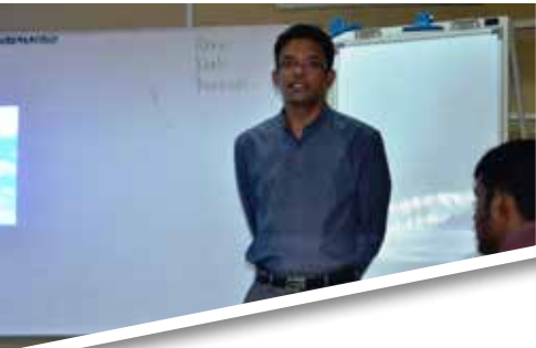
“Technical plus Enterprising by External Trainers”