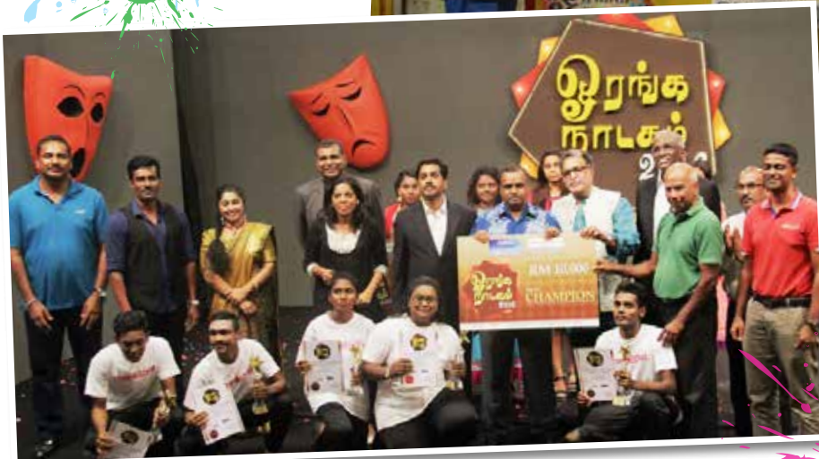
Winners of 2016 Orangga Naadagam Champion.