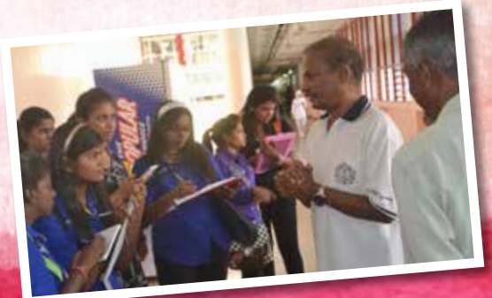
De-briefing sessions after the visit.

Students realise how important it is to overcome emotional obstacles in life during the sharing sessions they had with patients. They realise how important it is to be empathetic towards needy patients by providing comfort, understanding and reassurance.