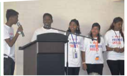
Psec Finals @Wisma Selangor Dredging.