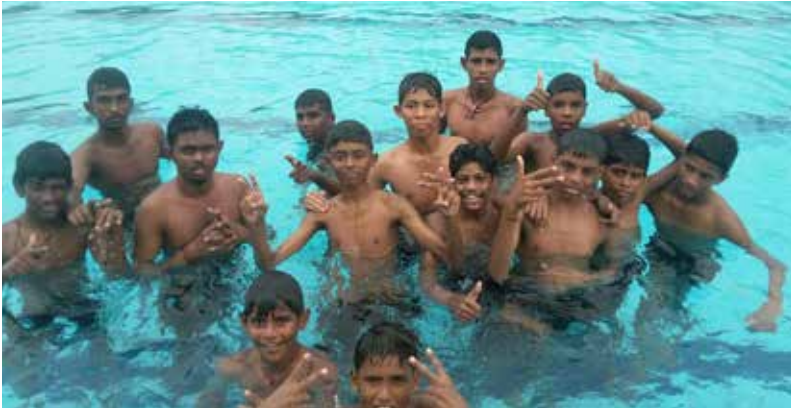
"The wet team on every weekend"