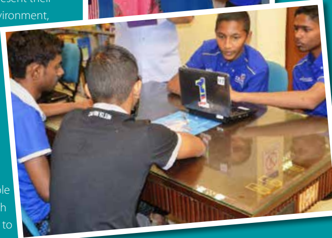
Diversifying local library for learning needs.