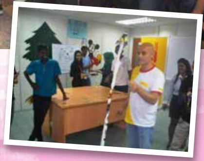
Team building exercise with the training