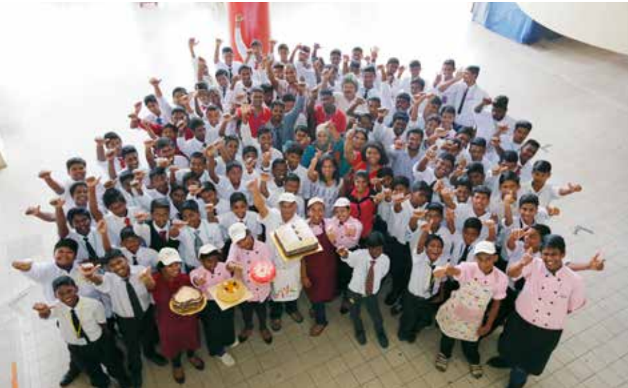
The port klang team!