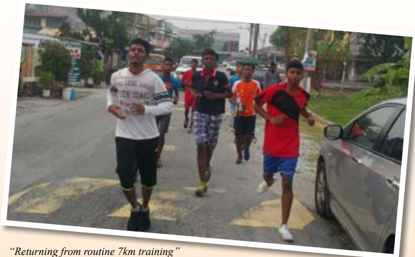
"Returning from routine 7km training"