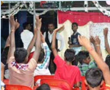
"Myskill Alimni force leading the saturday night fever."

They managed to get good response from the first 50 list as many shared that they are interested to gather and plan forward. These four boys never stop coming to centre and continuously engaging the current students sharing the values and qualities acquired after the transformational process happened within them.