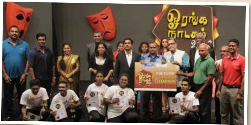
"2016 OranggaNaadagam Champions-Ethirneechal"

Words cannot express enough how we jumped out of joy when we were announced as the CHAMPION again! Despite coming from the poorest segment of Malaysian Indian community, dropped out from school,