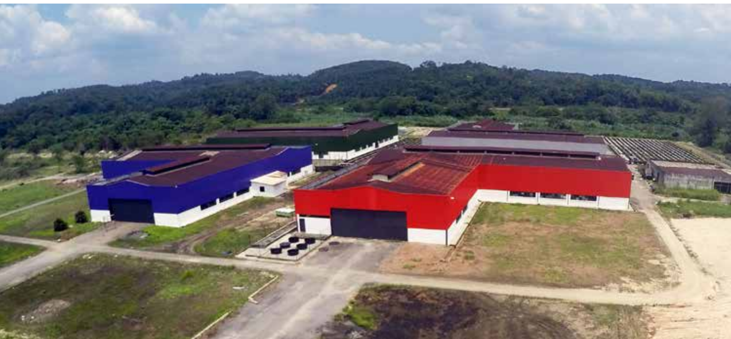
Front view of Kalumpang land: 4 factory lots on the land to be refurbished and upgraded