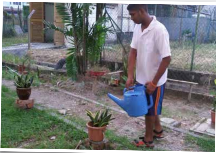
“Rainwater harvest supply for watering plants”

Green Project is a brainchild of Myskills; initiated after joining hands with SGP (Small Grants Programme) of UNDP in 2014/15. Students are taught and exposed to basic knowledge of why one should care and preserve environment through this project. They are encouraged to do gardening at the hostel backyard which includes