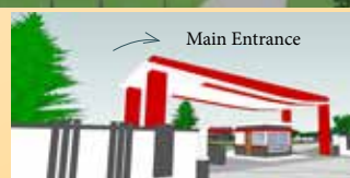
Model of Youth Transformation Centre , Kalumpang , Hulu Selangor