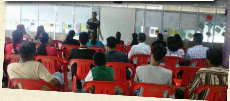
Facilitators of kip briefing at each respecting status to guide on registration progress.