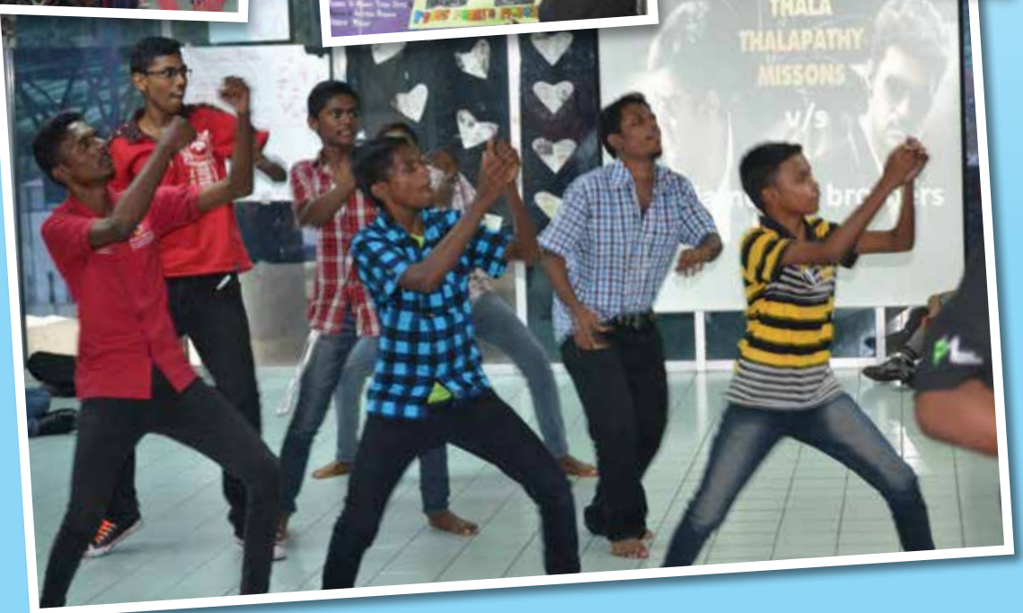
Dance, singing and drama breaking barriers to build confidence and self-esteem