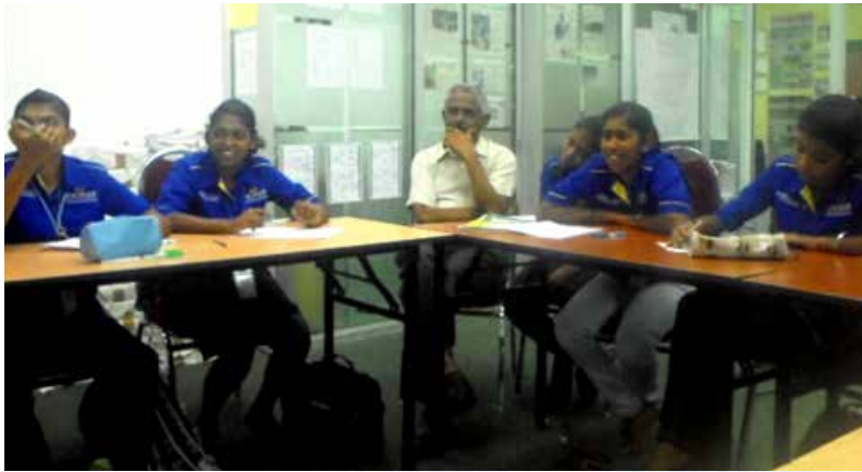
"Solving Mathematic Riddles"